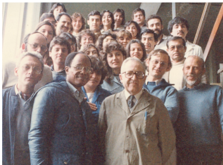
First plant molecular biology course, 1986, the beginning of plant molecular biology in Argentina.